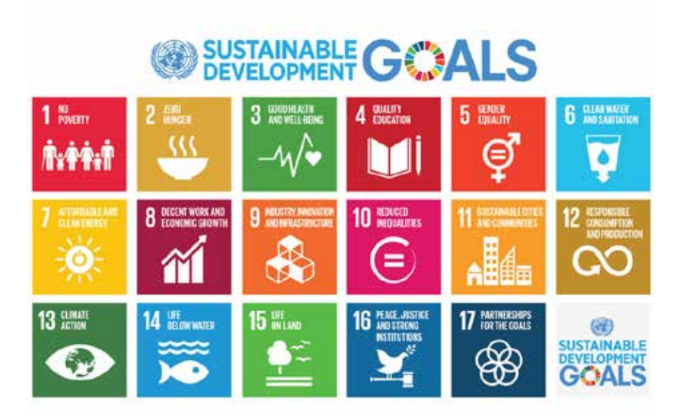
Figure 1: UN Sustainable Development Goals (United Nations, 2017; see http://www.un.org/sustainabledevelopment/news/communications-material/)

2030 and which cover a range of issues. This includes such things as No Poverty, Good Health and Well-Being, Quality Education, and Climate Action (see complete list in Figure 1). Several of these Goals, such as Good Health and Well-Being, Reduced Inequalities, Gender Equality, and Clean Water and Sanitation, depend squarely on the behavior of businesses, especially those operating in developing countries.