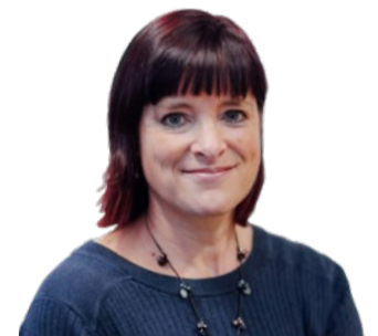
The number of women sitting on boards is moving backwards