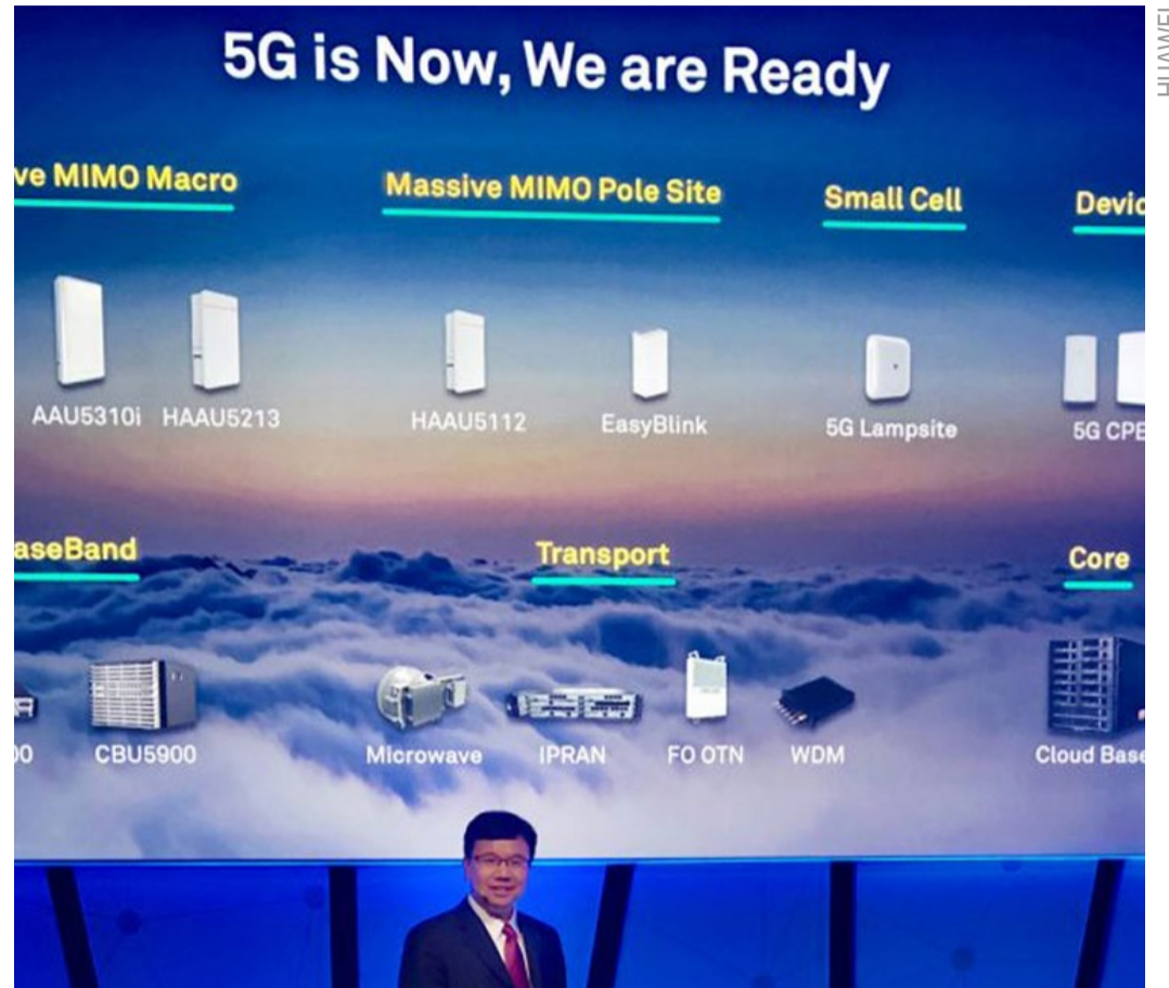
Huawei launches its 5G product line in Barcelona in February.

For Huawei, which is far from a household name outside China, a hefty dose of brand building is timely. If it’s going to take on the likes of Apple and Samsung, it needs to convince western consumers that its products aren’t